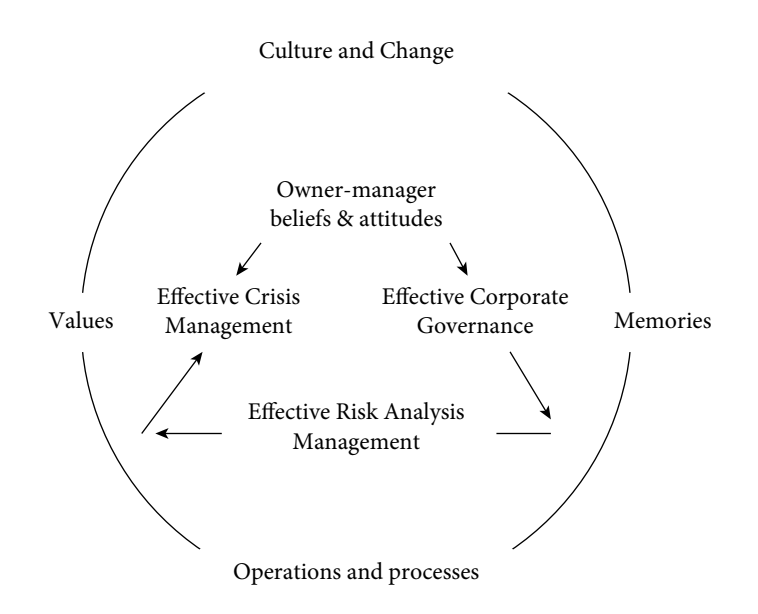
Figure 2. The context and relationships between corporate governance, risk and crisis management

L. Spiers, Corporate governance, risk and crises in small companies